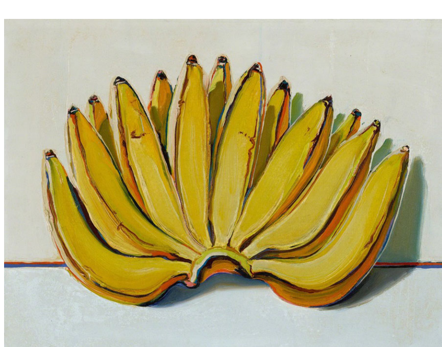
Bananas (1963. oil on canvas)