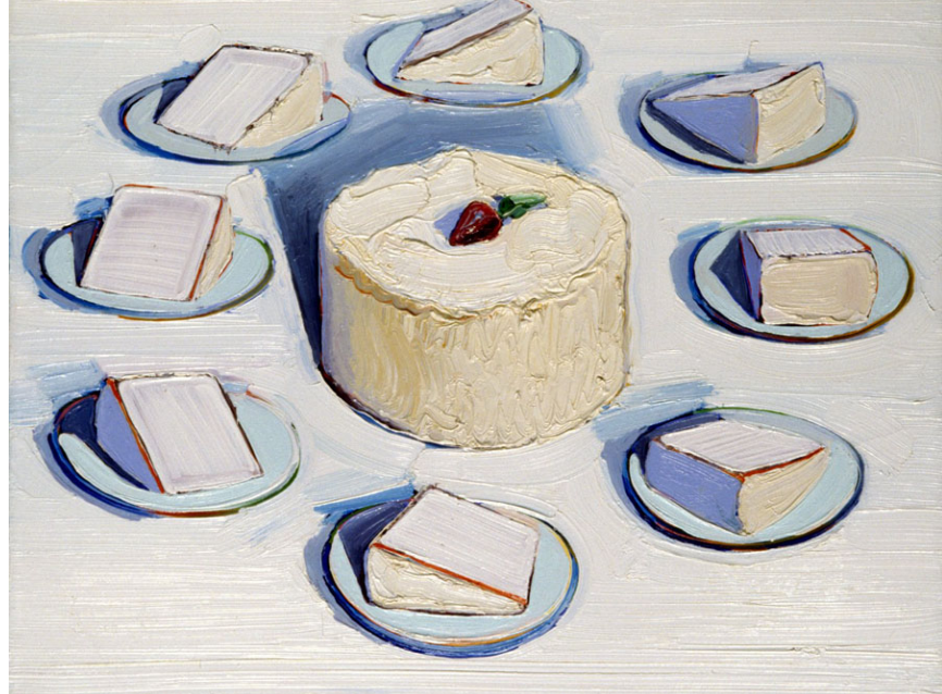
Around the Cake (1962. oil on canvas)