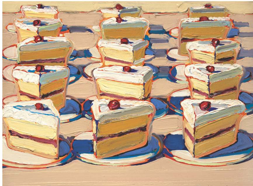
Boston Cremes (1962. oil on canvas)