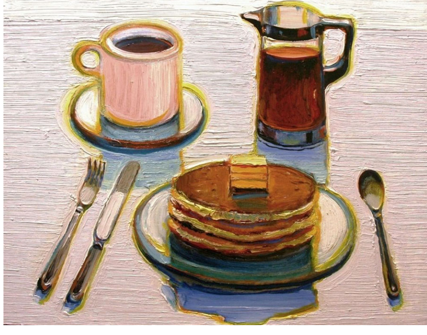
Pancake Breakfast (2008. oil on canvas)