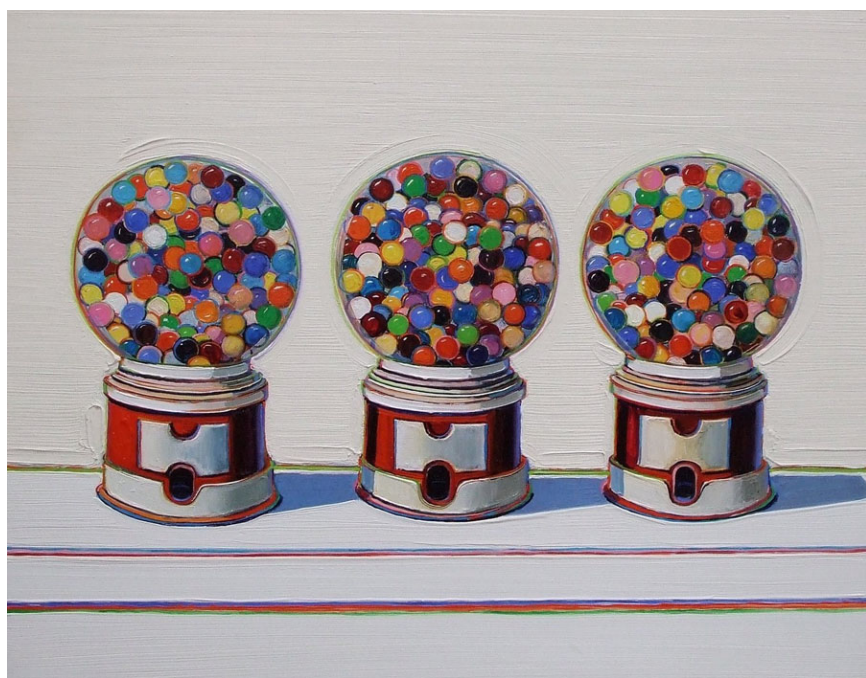
Three Machines (1963. oil on canvas)