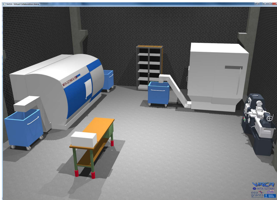
Fig. 2. A screen shot from the viewpoint of a collaborator

as end-users, then the VirCA NET platform was introduced focusing on its capabilities that fulfil these requirements. A concrete example for the collaborative design of a small manufacturing cell was investigated and the technical details of the implementation were discussed. Via this use-case study