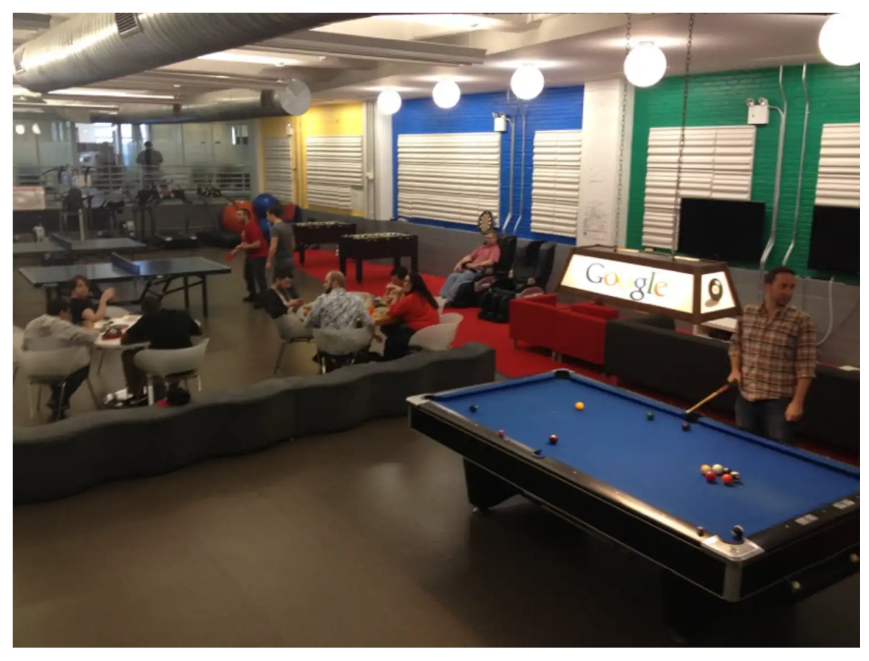
Silicon Valley has been faulted for its 'brogrammer' culture, which can be unwelcoming to women.

some men are shorter than most women. Although psychological sex differences are statistically smaller than this height difference, some of the differences most relevant to tech are substantial, particularly interest in people versus things and spatial ability in mental rotations.