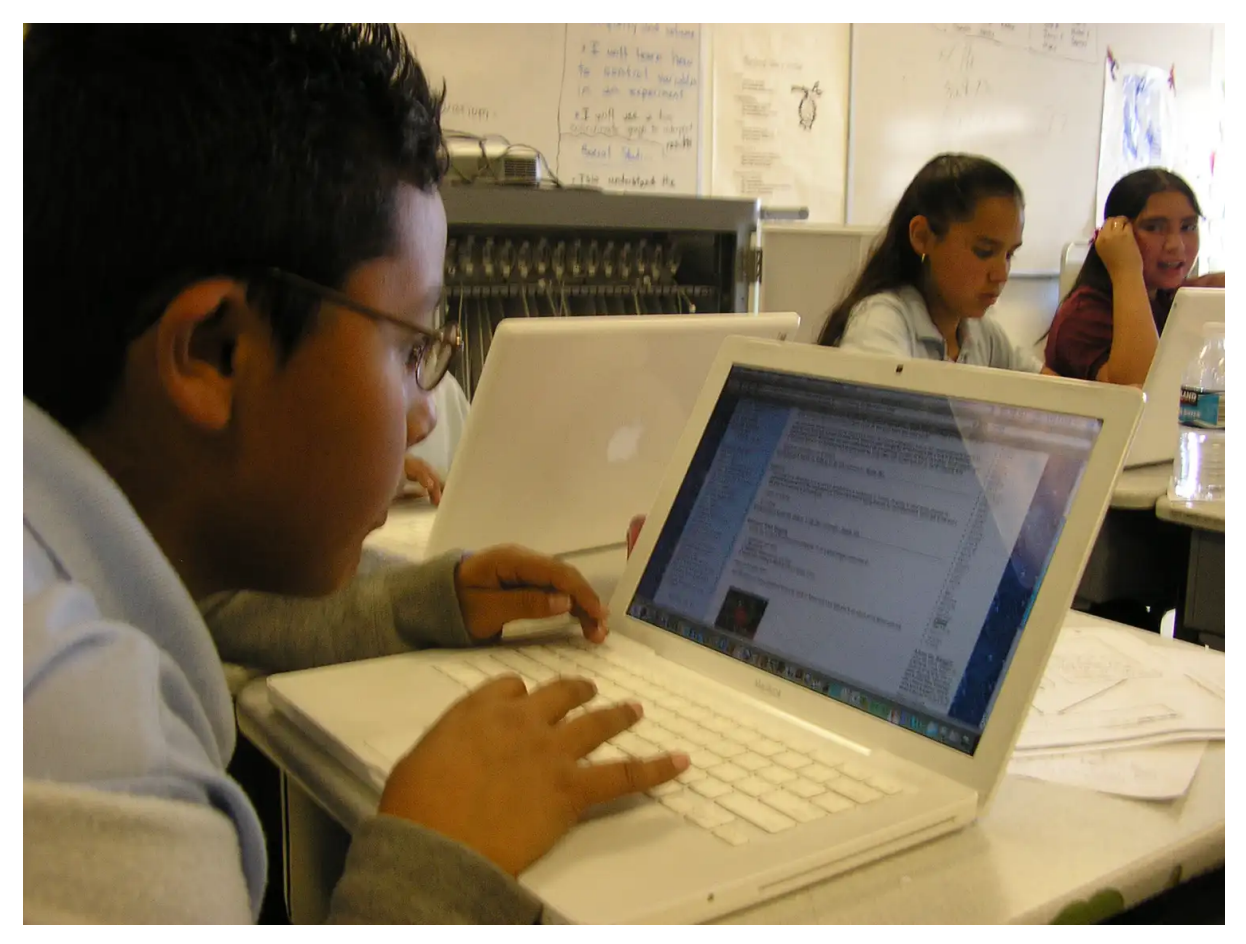
Any career depends on training and education that build on innate interest and talent.

It's therefore not surprising that research provides evidence that women generally have to meet a higher standard to attain jobs and recognition in fields that are culturally masculine and dominated by men. However, there is some recent evidence of preferential hiring of women in STEM at U.S. research-intensive institutions. Qualified women who apply for such positions have a better chance of being interviewed and receiving offers than do male job candidates. Experimental simulation of hiring of STEM faculty yielded similar findings.