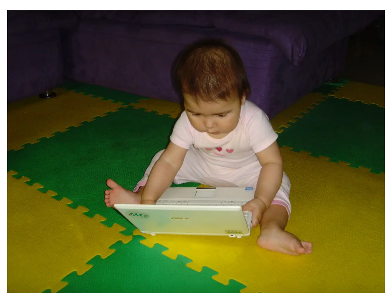
Is she a computer natural?