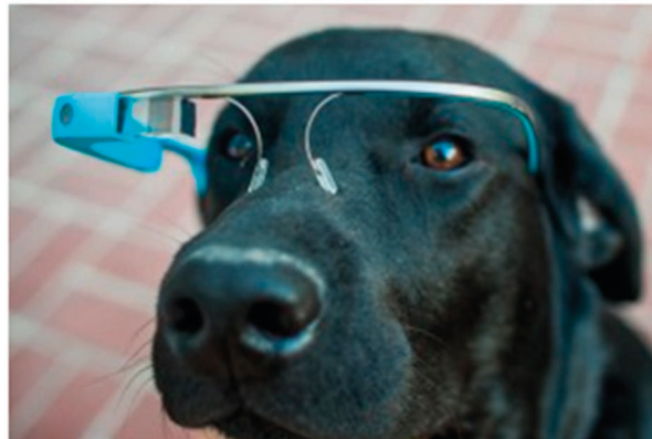
Fig. 1 Google Glass, Flickr Creative Commons, Thomas Hawk, May 2013

Future discussion on the privacy concerns for this expanding market of wearables that literally provide your location, activity, and health data will be necessary. Individuals have to decide if they want to have wires